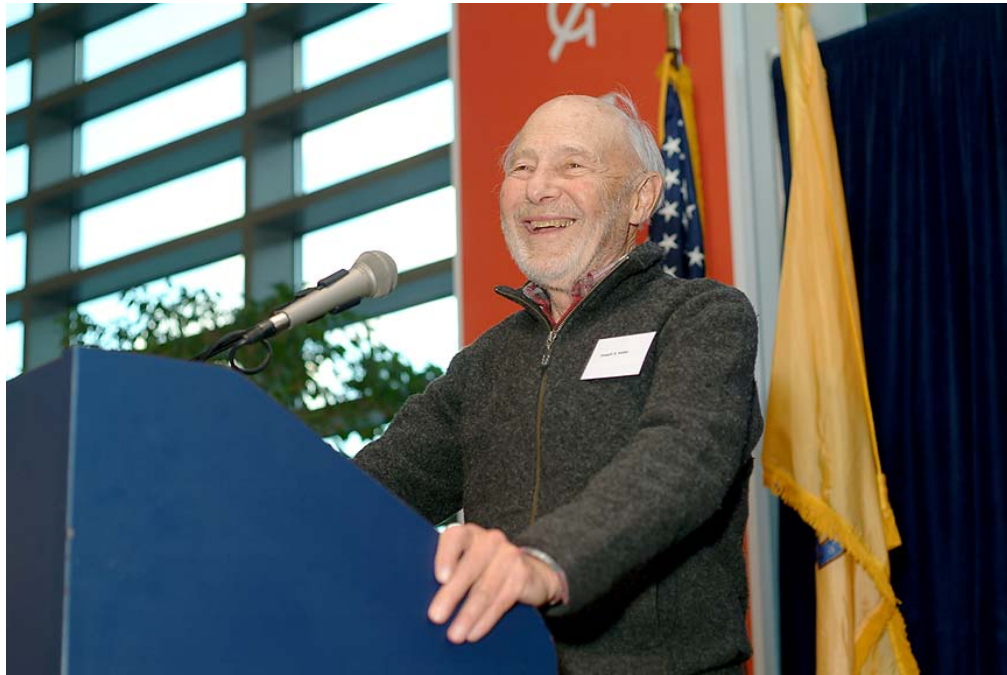
Professor Joseph B. Keller