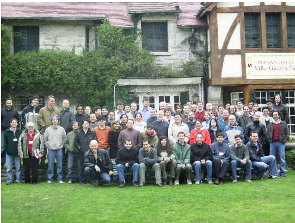
August 2007 PASI group photo